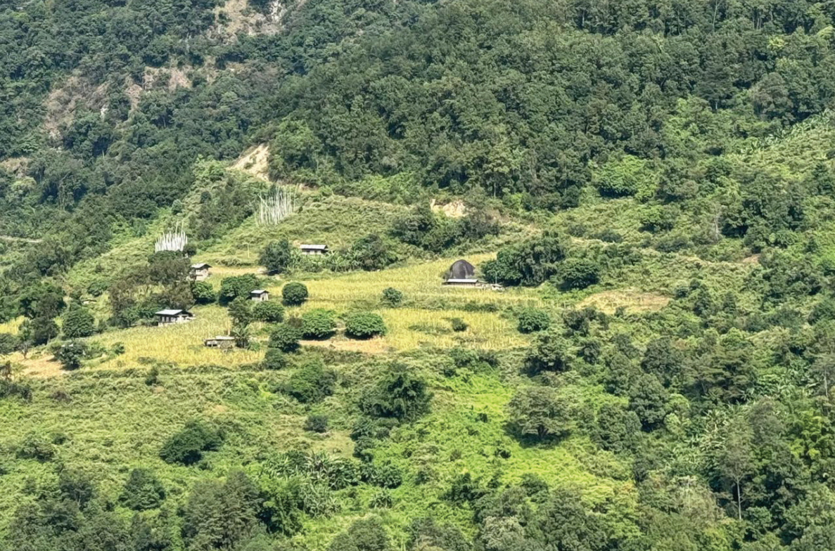
Phumchung village in Bardo Gewog, Zhemgang

a love marriage should be treated the same as an adult marriage and should not be classified as rape.”