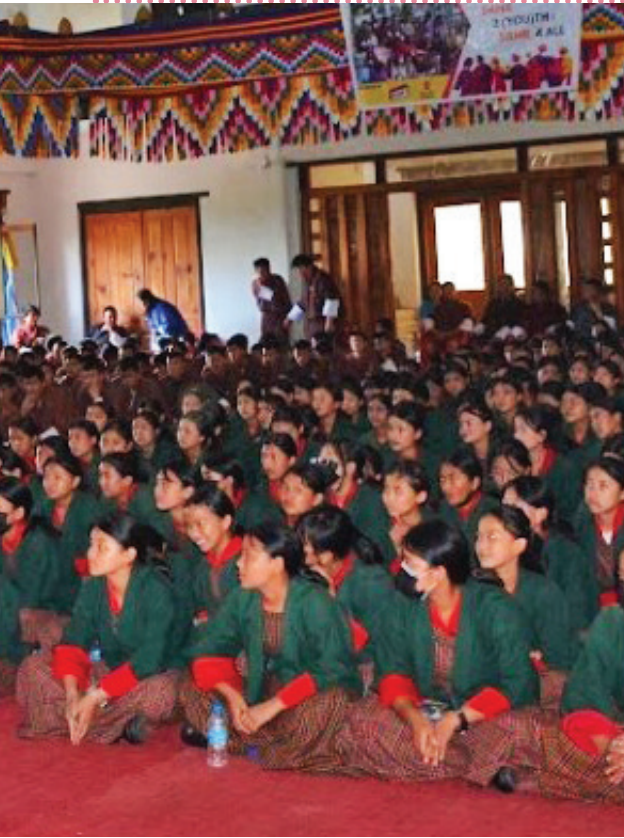
A Y-PEER member explains about SRHR

The team has reached out to over 1,000 students in Zhemgang, Mongar, and Trashigang. They educate students about SRHR and select those who will work as SRHR champions in their respective schools.